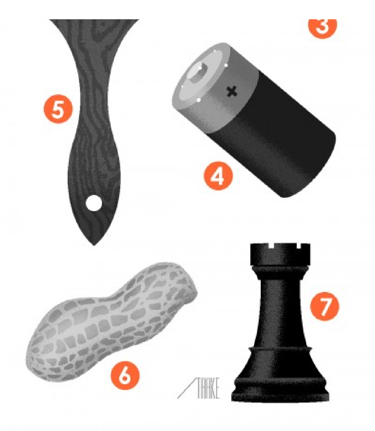
Well, yes, ordinary people will tell you they see an electric plug, a Lego piece, etc. But you aren't those people, right? (Bob Staake for The Washington Post)

By Pat Myers January 14 ► Follow @PatMyersTWP